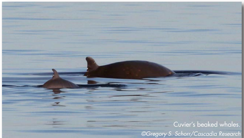
Cuvier's beaked whales.

So please, go through those photos and send us a few that you're particularly proud of. Include a caption, photo credit and permit number (as applicable) and be sure that the photos are in high resolution format. And who knows, you may see one of those photos in a future issue of the LMR newsletter. Submit your photos via email to: exwc_lmr_program@navy.mil